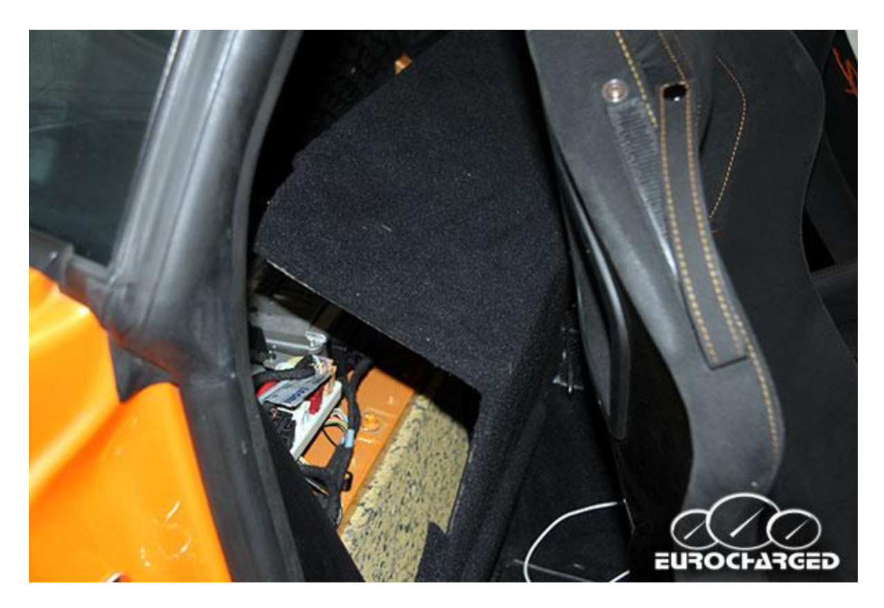
With the seats forward look at the back shelf. Gently pull the back shelf up and it will lift.