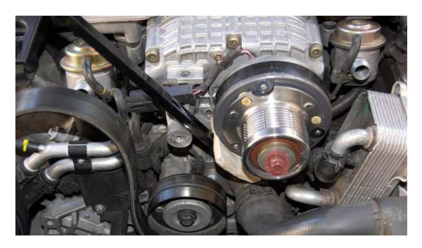
Step 5- Remove the bolt and washer from the front of the pulley