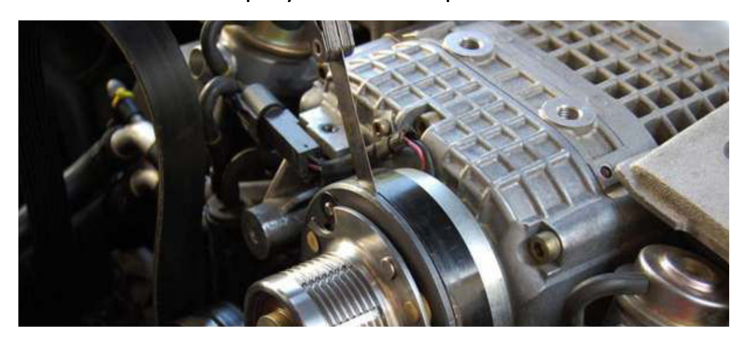
The SC pulley bolt should be torqued to 20nm.

Step 7- Place the new pulley on the shaft, and replace the stock washer and bolt. Tighten them down using the previous method of holding the clutch. Check the gap between the back plate and the clutch. It should be between .20-.30 mm. The important point is that once tightened, the pulley and clutch spin freely of each other, while being as close as possible. If you need shims for you pulley contact us and we can provide them to you.