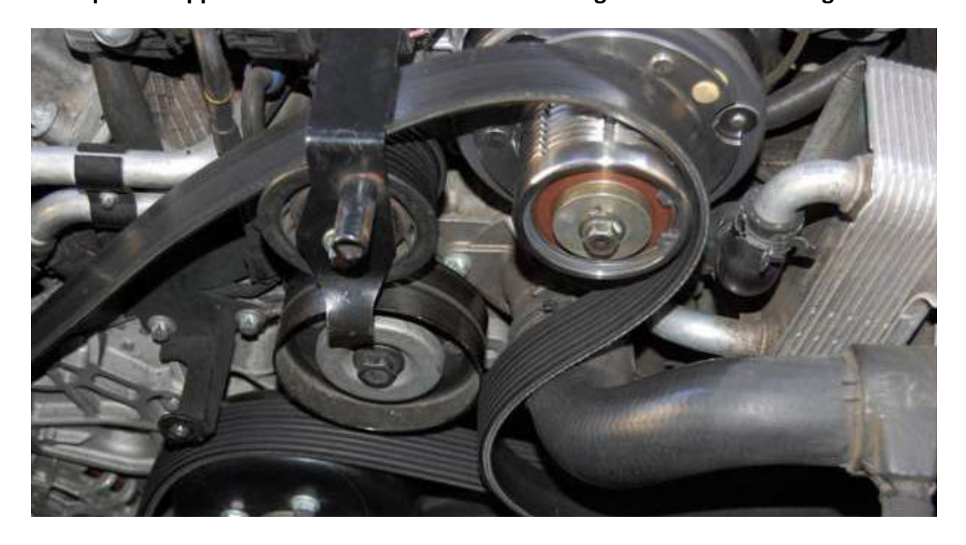
Step 9- Go over each bolt and ensure it was tightened properly. Turn the SC Clutch by hand, and it should spin freely. Check the belt for proper alignment on the pulleys. Once everything has been verified, start up the car. Observe the belt and pulleys, making sure there is no awkward wobbling or noise. If all look well, go have some run on the road.