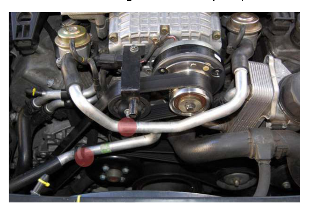
Step 2- Using the E11 torx, loosen the belt by turning the tensioner counter clockwise. Slip the belt off the middle idler.

<u>Step 1</u> - Remove air injection tubes by removing the two hightlighted bolts. These require the E10 torx. Pull the tubing out of the three points, and set aside.