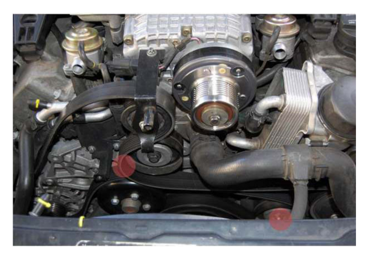
Step 3- Remove the upper idler pulley. The bracket bolt is a E10 torx. The pulley is a E12 torx. Remove both the pulley and bracket